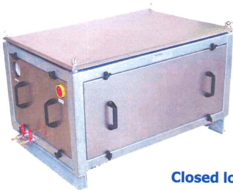
Closed loop recirculation chiller system CRC-1700 serie